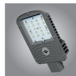
LED Street Light