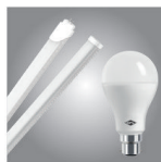
LED Bulbs & Tubes