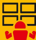
Monitoring & Controlling

hpl@hplindia.com | Ph.: +91-120-4656300 Customer Care No: 18004190198