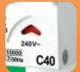
Contact Position Indicator