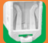
3 Position Mounting Clip