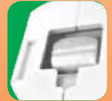
Cable Termination upto 35mm 2 Cable