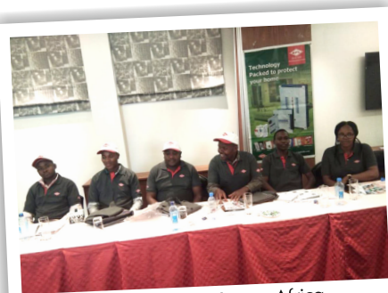
Retailer Meet @ Kenya, Africa

“ Export team has recently organized a retailers meet in Kenya. ”