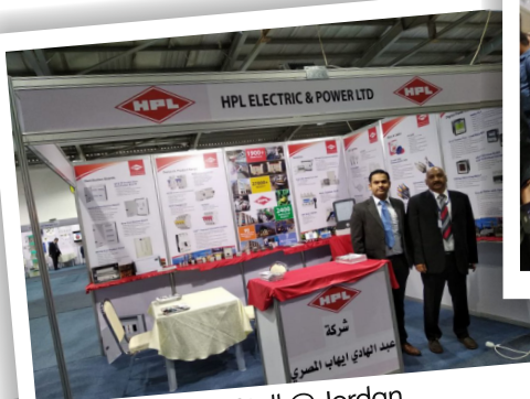
HPL Stall @ Jordan