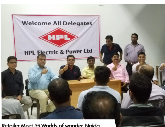
Retailer Meet @ Worlds of wonder, Noida

Training and ground level promotions strategy for quick shelf movement of the products