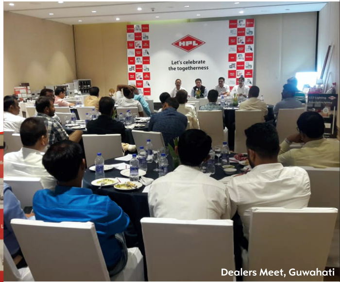
Dealers Meet, Guwahati