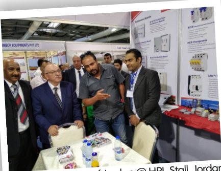
Housing Minister of Jordan @ HPL Stall, Jordan

Housing Minister of Jordan & Energy Minister of Palestine visited HPL stall @ JordanBuild Exhibition, Jordan