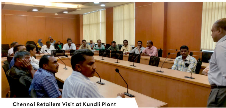
Chennai Retailers Visit at Kundli Plant