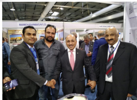
Energy Minister of Palestine @ HPL Stall, Jordan

“ Export team has recently organized a retailers meet in Kenya. ”