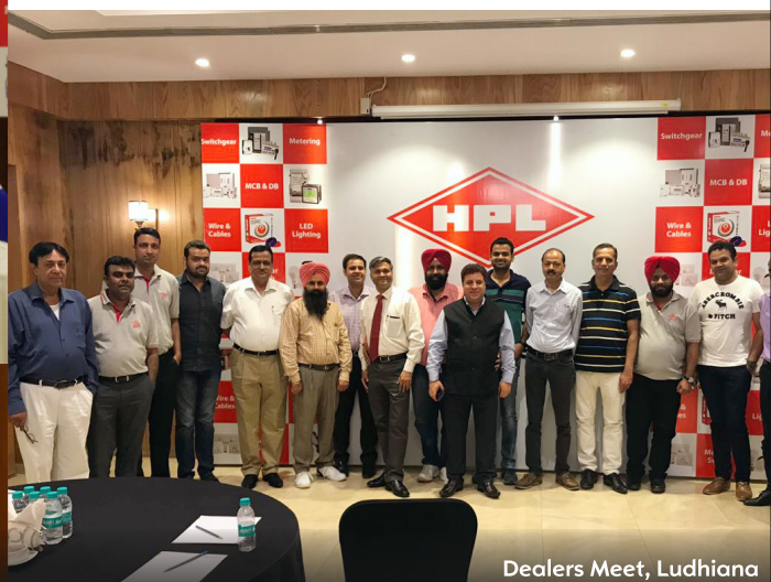
Dealers Meet, Ludhiana

“ Pan India dealers and retailer meets are being strategically organized in 26+ cities for product awareness and one on one interaction with dealers for an effective and stringent growth in the market share. ”