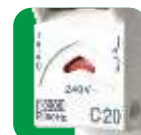
Contact Position Indicator