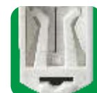
3 Position Mounting Clip