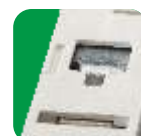
Cable Termination upto 35mm 2 Cable