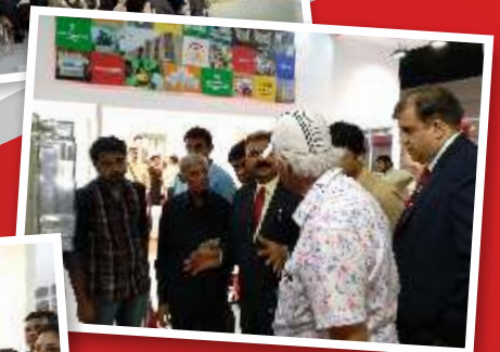
Trustee of BSE