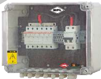
Solar Junction & Distribution Box