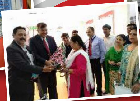
Member of Indian Parliament Neelam Sonker, Azamgarh, UP