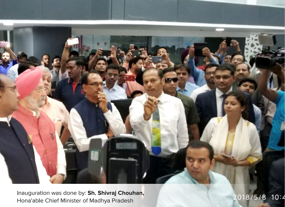
Inauguration was done by: Sh. Shivraj Chouhan , Hona'able Chief Minister of Madhya Pradesh