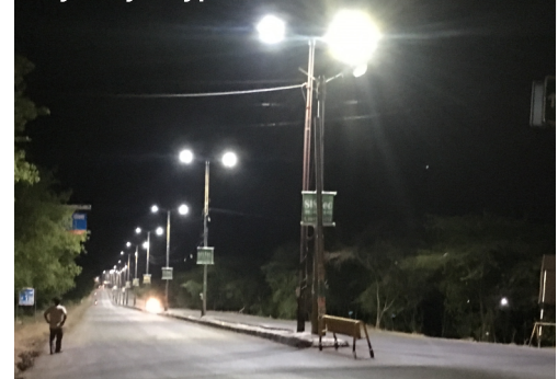
Roshan Pura Square